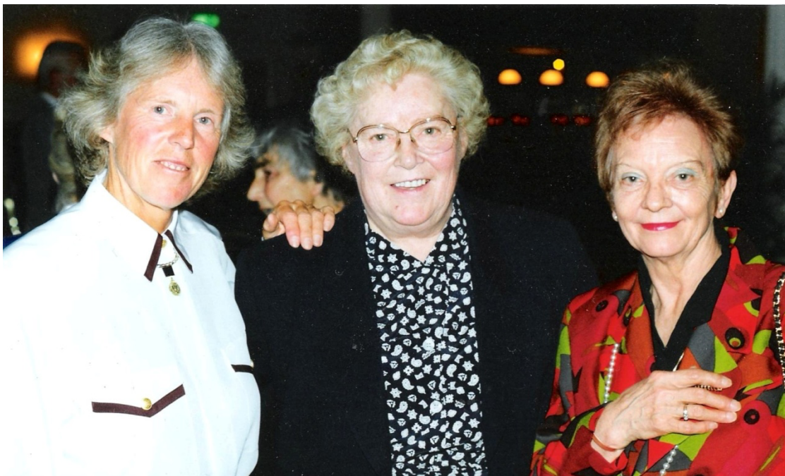
Ann Haydon (Jones)

Only three years after taking up the sport, 1946 was the year everything took off when she won her first of 13 consecutive Women's Singles Titles at the Scottish Open. She also won the Irish Open Women's Singles Title in 1946.