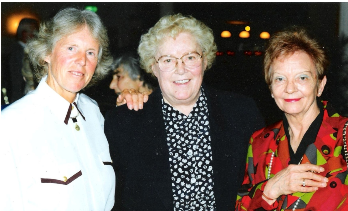
Ann Haydon (Jones)

Only three years after taking up the sport, 1946 was the year everything took off when she won her first of 13 consecutive Women's Singles Titles at the Scottish Open. She also won the Irish Open Women's Singles Title in 1946.